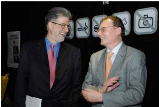
Espacio Público President Eduardo Engel with James Robinson, shortly before his presentation.