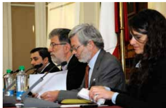
The conference was the final milestone of a research project lasting over eight months.